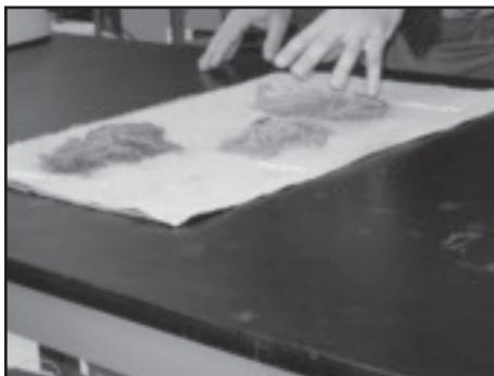
A display of varied real liver blood vessel networks, some sparse, others growing more thickly, that the lab is growing and nurturing as part of the research to improve liver function