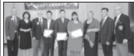
From Rowers to Lions – induction ceremony of 3 new members