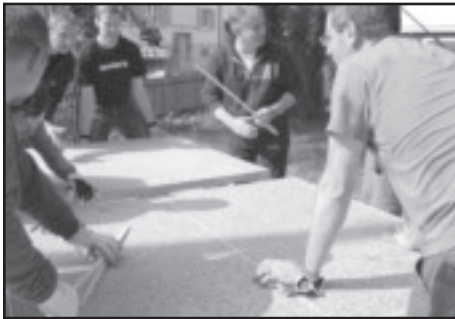
The pingpong table nears completion

Members of the Basel Dreiländereck Lions Club put in more than 800 hours improving indoor and outdoor spaces dedicated to play at the Basel Children's Home. Members reconfigured an indoor area to provide separate spaces for watching movies, reading and "chill-out" corners.