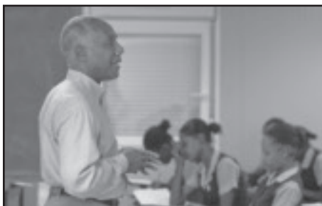
Nursing school students listen to a class lecture at the school in downtown Port-au-Prince