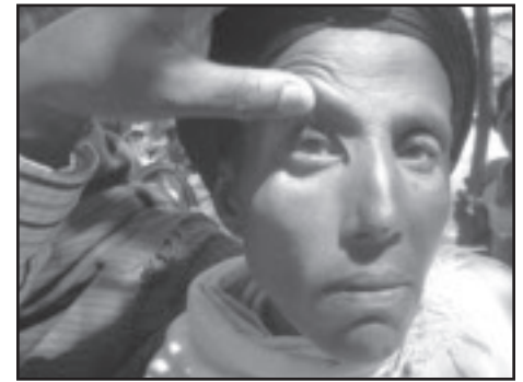
A woman in Ethiopia has her eyes screened for trichiasis

By researching vision loss and eye care needs in these regions, SightFirst and LCIF will have a better understanding of eye care needs and priorities. Together with the trachoma research initiatives, these grants will lead to more effective treatment and blindness prevention in the future.