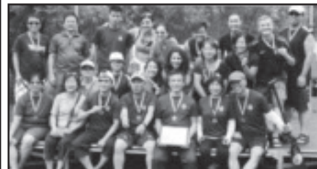
The Heritage Lions Grrr team