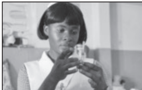
A student prepares an injection for a patient