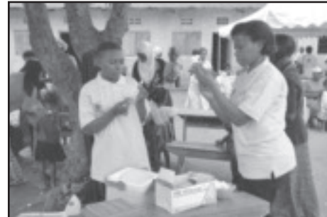
Health workers at a vaccination post in Uganda prepare to vaccinate more children against measles

Together, we can help eliminate measles. Just ask the Lions of Uganda.