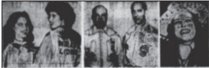
Left: This lovely group representing the State of Indiana, State National of New York and Ladies' Brotherhood of Y. M. C. A. in their traditional and gold and white. Right: The actress dressed in the Union Jack as the personification of Canada.

The Gardens was of course still resonating from the first ever "down 0-3" comeback by the Maple Leafs to win the Stanley Cup a few months before and Whipper Billy Watson was "rasslin" the next night but can you imagine some 8000 Lions closing this convention with a long version of "Auld Lang Syne"