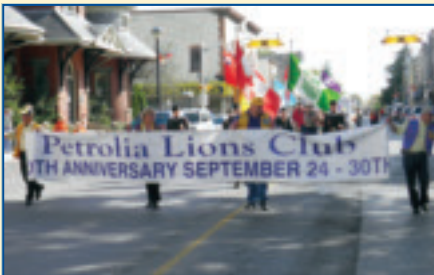
Petrolia Lions lead the Lions Parade on Petrolia Line Road right through downtown Petrolia

Sept. 24 to 30th 2012 was Petrolia Lions Week in Petrolia Ontario. A whole week of activities was planned including an All Lions Parade on Sept. 29th.