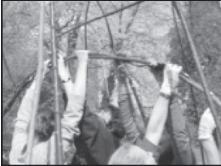
Lions build a "summer igloo"

Lions in Switzerland worked so underprivileged children could play.