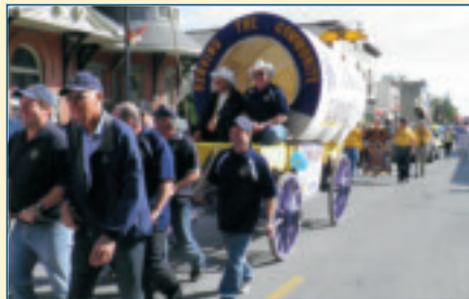
Wyoming Lions from Wyoming, Ontario came and pulled their Covered Wagon, Chatham Lions (behind) came the furthest