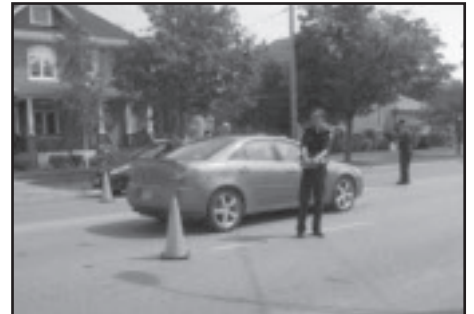
Firemen doing the boot drive in raise funds for Goderich tornado disaster relief