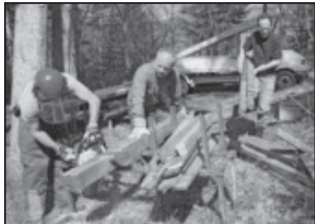
Lions get the trail ready for another year of recreation

The trail does more than provide recreation: it also imparts lessons on sustainability. A bowling pin game along the trail subtly illustrates the benefits of partial harvesting of trees. Placards in the woods recount how for years trees in the region were cut