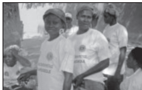
Lions promoted the measles vaccination campaigns including through T-shirts, radio announcements, banners and through word-of-mouth

Statistics from the Task Force for Global Health, World Health Organization, Gates Foundation and Measles Initiative.