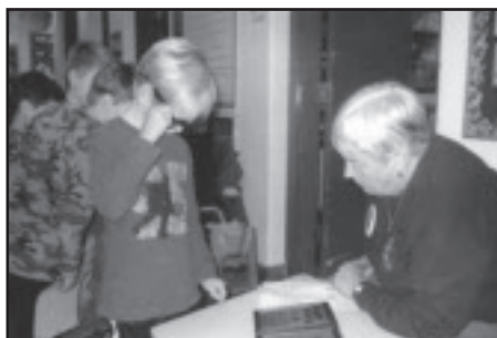
Kendal Lions working with the children