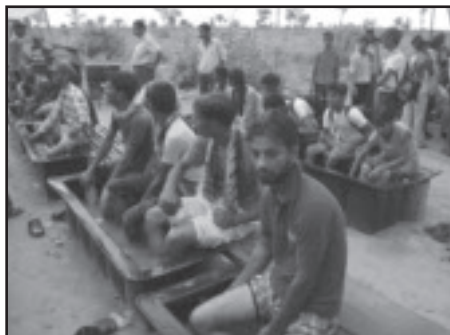
Religious devotees soak their feet after a long journey

To provide instant, soothing relief, the club also sets up saline water tubs that fit 50 people. A Lion who is a mechanical engineer constructs the tubs. Also, a Lion who is an electrical engineer oversees a charging board that can serve 80 cell phones at a time. Lions also provide safe drinking water, free medicines and even a band that plays folk songs.