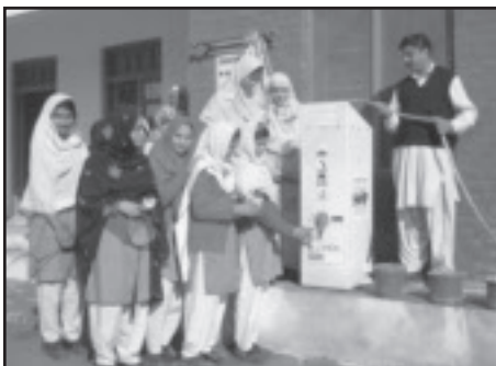
A “Paul” provides safe water to students

Lions in Germany also provided clean water for 3,240 students at six girls’ schools in Kyber Pakhtunkwa Province. The dirty flood waters contaminated water pipes. So Lions installed a