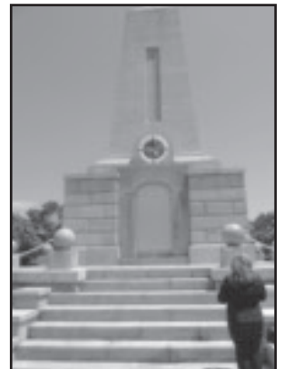
Kocasinan prays at the tomb of the sailors who died in the 1890 shipwreck