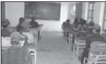
Students are learning again thanks to Lions

“When there is a lack of government schools, children are often exposed to radical elements. This is why building schools will help bring peace.”