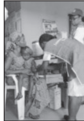
In Nigeria, Lions held two vaccination campaigns in an effort to reach all infants nationwide

Lions played a key role in all levels of the program. They raised funds, promoted the vaccination campaigns and built partnerships with governments and health sectors to grow the programs nationwide.