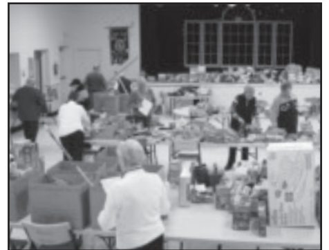
Lions & volunteers arrange toys for specific age groups