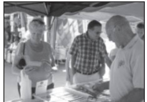
Shoppers browse the Lions’ bookstall

The sun shines day after day in Teulada-Moraira, a small resort town on the coast in Spain. Crowds of tourists and locals, many retired, flock to the sandy beaches, where paperback books are de rigueur. That’s why Lions staff a bookstall twice a month. In four years they’ve sold 20,000 books, some of them several times after thoughtful patrons return them.