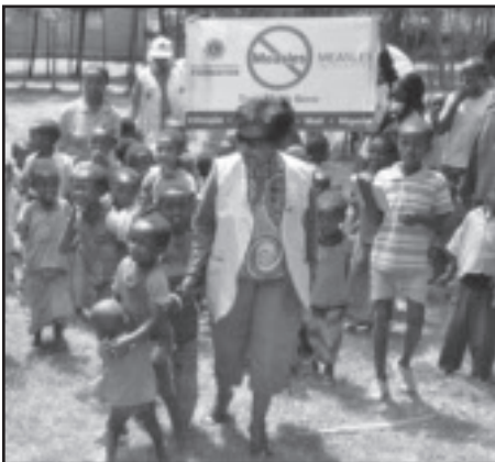
Lions in Ethiopia led grass-roots efforts to educate families on the need to get their children vaccinated

To support this program, donate online at www.lcif.org/donate or learn more at www.lcif.org .