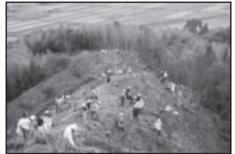
Lions and others plant trees on Kasamatsu Yama