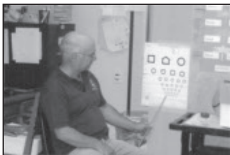
Kendal Lions vision Screening