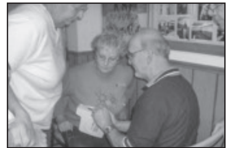
Millbrook Lions train new Vision Screeners