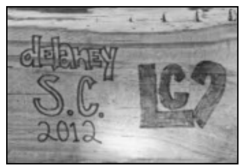
The most common graffiti at the camp is the LC Love symbol, signifying the affection for the camp

Taking matters into their own hands, they founded the Louisiana Lions League for Crippled Children, Inc.