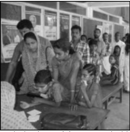
In Kerala, India, students sign up for free vision screenings through the Sight for Kids program

"It is a highly rewarding and satisfying experience to provide vision correction to students whose problems would have remained undetected but for the Sight for