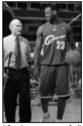
other payroll, but the former owner of the Cleveland Cavaliers is more impressed by the feats of the blind than by slam dunks