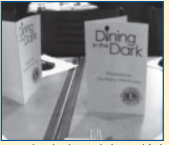
from event going to C.N.I.B.