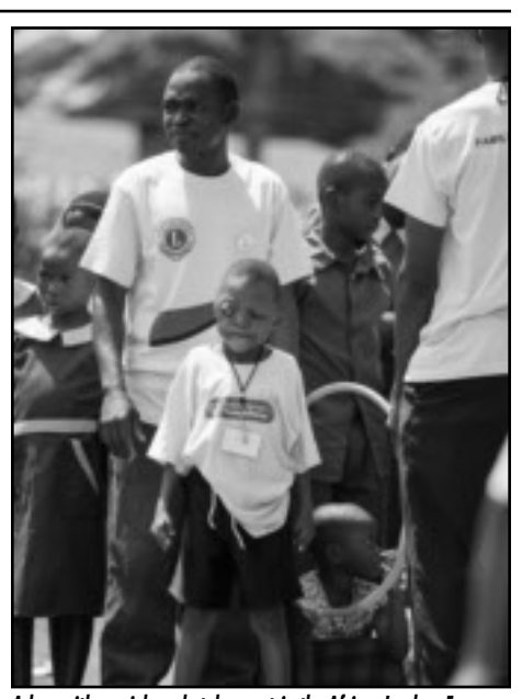
A boy with special needs takes part in the African Leaders Forum on Disability in Malawi. Forum brought together more than 100 families of

In addition, an LCIF-sponsored Family Health