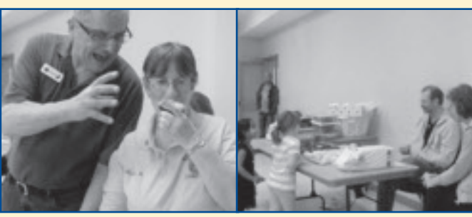
Easter Eggstravaganza cupcake decorating with Nancy Island Lions