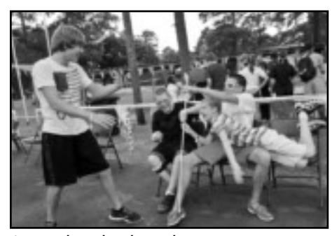
Campers and counselors joke around

The camp is completely free for boys and girls in the state. Louisiana Lions cover the costs, and many clubs sponsor local children for whatever additional cost it might take to get them to camp. Clubs also