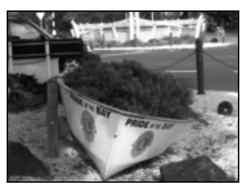
The club's boat is a fixture in the beach town

Zany New Zealanders celebrate the 50th anniversary of their club in style. Watch the amusing video at www.lionmagazine.org.