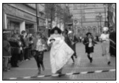
Among the racers are the mayor of Rugby (dark dress) and an editor of the Rugby Advertiser (white wedding dress)

Contestants bring their own frying pans, which must be at least seven inches in diameter. A national lemon juice manufacturer provides the pancakes–entirely inedible plastic spheres. The real ones with flour and milk bit the dust a few years ago because, well, they literally ended up in the dust. "We had problems when it was windy. The pancakes were so light they'd end up in the street when tossed," says Byrne.