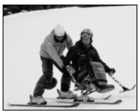
People with disabilities enjoy the hotel year-round