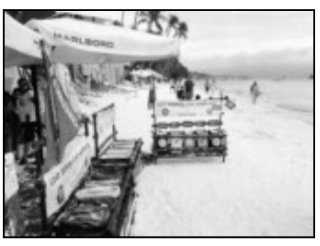
The Boracay Malay Amity Lions Club in the Philippines organized an environmental awareness campaign to make separating trash from

Read the rest of the 100 Touchstone stories written for Lions' centennial at Lions 100.org.