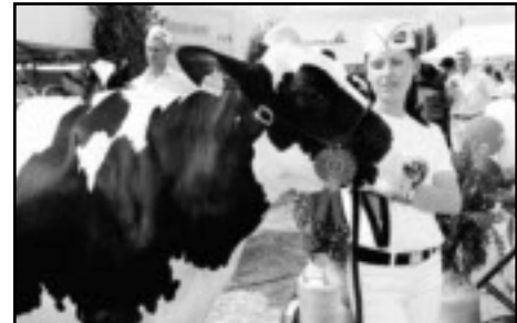
This cow won a top award at the OKRA Fair

The 39-member Lions club partners with 30 other local groups to run the fair, which requires a staff of 350. The club gives each group 20 euros (US$22) for each work hour. The networking is true to the theme of District 107 A: "Together we can reach our goals." Yet Lions are sure to emphasize their leadership role: children at the fair are given balloons with the Lions logo. The next OKRA Fair is in July.