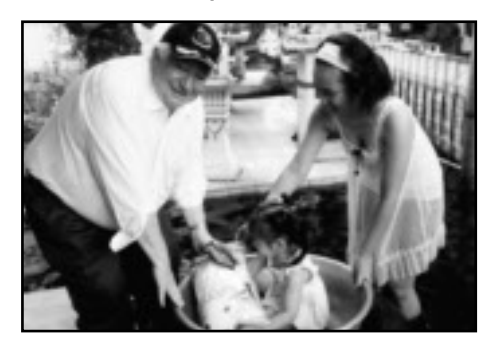
LCIF Chairperson Palmer assists with disaster relief in Thailand