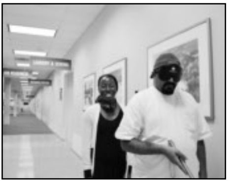
The Lions Vision Center at the Johns Hopkins Wilmer Eye Institute provides important rehabilitation services to people who are blind or visually impaired throughout the greater Baltimore area