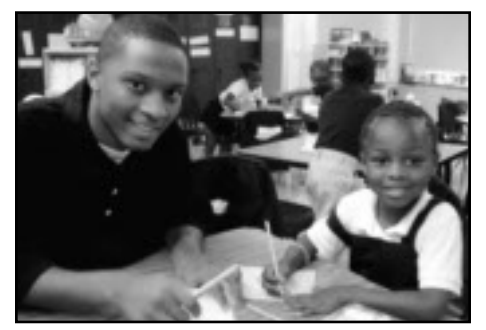
Lions Quest teaches character education in schools