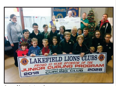
Group of happy junior curlers

In recognition of the support, the curling club has named the Lions Clubs of Lakefield as sponsors for the Lakefield Juniors' Sunday Curling League. This will provide no cost junior curling for up to thirty-two of our youths each year for the next ten years.