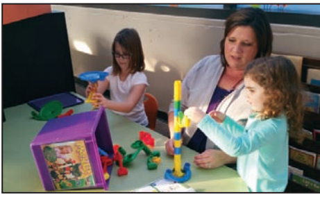
The Mau family enjoys the courtyard