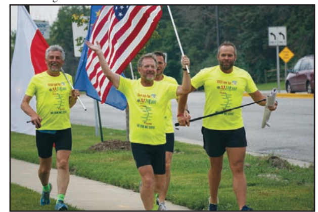
The Polish runners jog near Chicago

But all in all, the heartland lived up to its name. Welcoming Lions invited them into their homes and