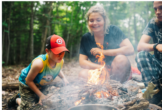
All excess funds support programs like D-Camps

Recipients of this honour may also qualify for supplementary awards within a single calendar year. Awards will be conferred upon confirmation of the contribution.