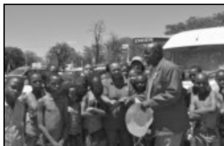
Lions in Africa work tirelessly to prevent measles. The Lobatse Lions in Botswana publicize the dangers of measles