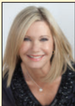
Olivia Newton-John will be the keynote in Toronto

Newton-John will be the keynote July 8 at the 97th International Convention in Toronto. She'll sing, of course, as well as talk, entertaining and edifying, an apt representation of what's in store for the thousands of Lions worldwide who will descend on Canada's largest city.