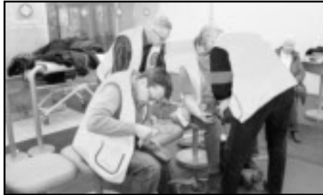
Lions fasten ice grips to shoes

At times the lines were lengthy. But Finns don't grouse much about the wintry weather or needing to overcome it. "Everyone was in a good mood, so it didn't matter that people had to wait," according to the Finland LION.