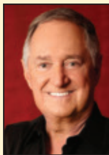
Neil Sedaka will headline the International Show

Besides the fun and fellowship, convention represents a golden opportunity to improve your club and renew your own enthusiasm for being a Lion. Led by experts and leaders, the convention's seminars run the gamut—from the latest information on popular Lions programs such as Lions Quest and Youth Exchange to tools and strategies to increasing membership and strengthening