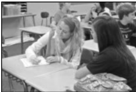
More than 13 million students are learning positive life skills and participating in service learning through Lions Quest

In fiscal year 2012-13, Lions, their partners and friends generously donated $35.6 million to LCIF. The Foundation awarded 489 grants totaling $39,297,388. View the rest of the Foundation's finances at www.lionmagazine.org . Thank you for believing in LCIF!