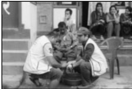
Lions from Nepal aid a pilgrim from the religious walk

Partnering with the Red Cross, 17 Lions provided first aid, foot massages and water to walkers for eight hours. Chartered last July, the club also organizes blood donations, distributes wheelchairs, sponsors cataract surgeries and will establish a library.