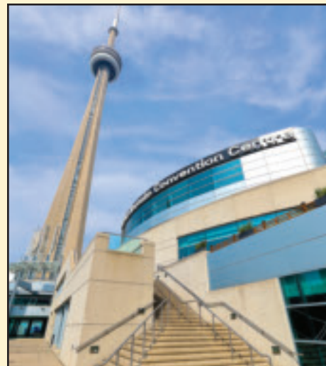
The Metro Toronto Convention Centre will host the exhibit hall

Why attend convention? Lions will tell you in a short video at www.lionmagazine.org . Also watch videos on the amazing Catapult Entertainment and Neil Sedaka.