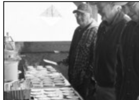
Buckets collect the sap, which is then boiled, turning into the maple syrup that is slathered over the Lions' grilled pancakes