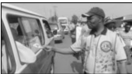
A Lion in Zambia hands information about measles to a motorist

“It is something easy to do, but it can mean the difference between life and death.”