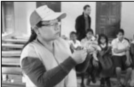
More than 11,000 Lions in Nepal helped mobilize communities in the measles campaign there

Roger Bannister, a 25-year-old, little-known medical student in England, made history in 1954 when he ran the mile in under 4 minutes. Elite runners had been trying for years to crack the 4-minute barrier. Some observers speculated that such a feat was impossible. People could run only so fast. They believed we had reached the limits of speed. When Bannister broke the tape about half a second under