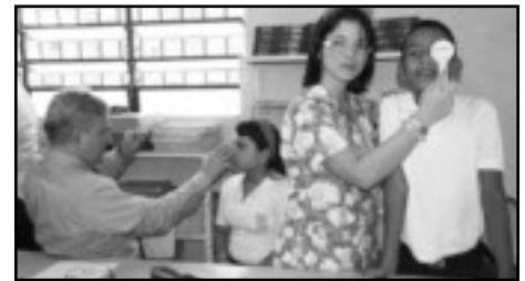
Eye care professionals screen students at Andrés Bello School

Last fall ophthalmologists and other eye care professionals screened 68 children in first and sixth grade. Lions partnered with the Aragua Regional Eye Center, the Aragua Eye Clinic and health workers in nearby La Victoria. Founded in 1620, Cagua is an industrial city with 130,000 people.