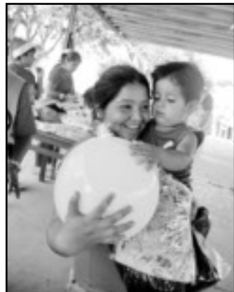
A mother and her child enjoy the Christmas party

chocolate milk, and, of course, toys. The mayor of the Sausal District worked with the Lions on publicizing the event.