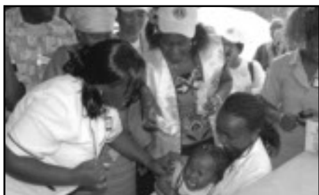
Lions in Kenya assist at a measles vaccination

LCIF has now partnered with the GAVI Alliance to continue this important work. Lions will raise $30 million for measles and rubella by 2017. These funds will be matched by the United Kingdom's Department for International Development and the Gates Foundation, bringing the total to $60 million.