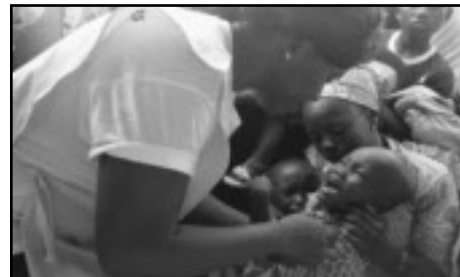
A health care worker vaccinates a child in Tamale, Ghana