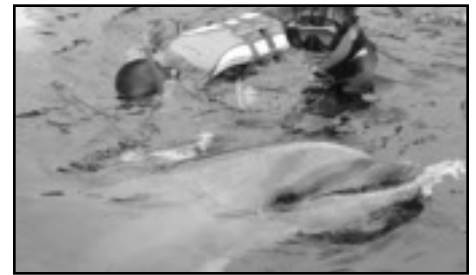
A child with a guide approaches a dolphin in Ito Harbor