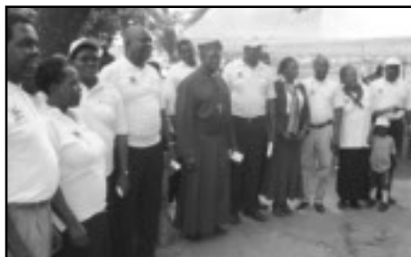
Lions in Uganda hold rallies, meetings and parades to spread awareness of the immunizations