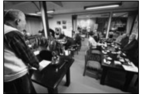
Iidate Lions now meet at this restaurant, which led to the owner becoming a Lion