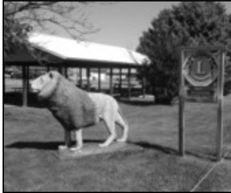
I met multitudes of Lions as well as ample reminders of our service. On my way out of Hysham, Montana, I passed Lions Park

but I couldn't sleep because I knew I had a lot of ground to cover. My trip odometer showed 570 miles ridden. To stay on schedule, today I need to ride nearly 100 miles with 4,000 feet of climbing.