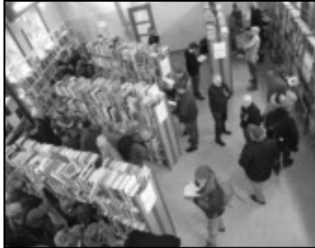
Bibliophiles crowd the Lions' sale

Proceeds support many causes: guide dogs, Scouts, youth sports, outings for senior citizens, a drug-sniffing dog for federal agents, schools and orphanages in Ghana, and nutrition, health care and female entrepreneurs in Mali.