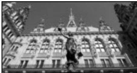
The Rathaus (town hall) is the symbolic heart of the city