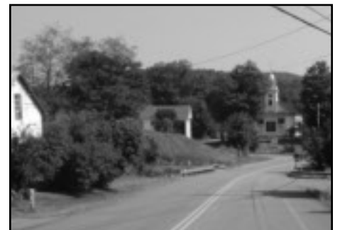
Vermont was one scenic view after another including this church in a small town and a covered bridge

Today I put in more than 100 miles and climbed 5,500 feet. The sun set hours ago. But I kept going. It's my final day of my seven-week journey across America. I am a mere two miles from Portland, Maine. Today has once again brought heat and humidity as