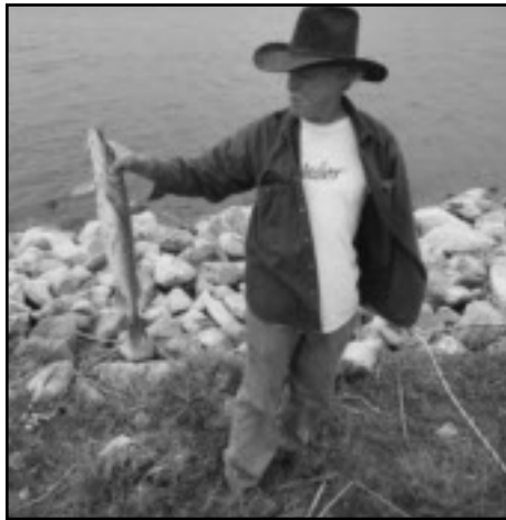
While traveling along the interstate in North Dakota, I passed by a lake where this man had caught an impressive Northern Pike

They made me laugh, too. Time and time again I heard "you have only 1,100 miles to go!" Easy for them to say!