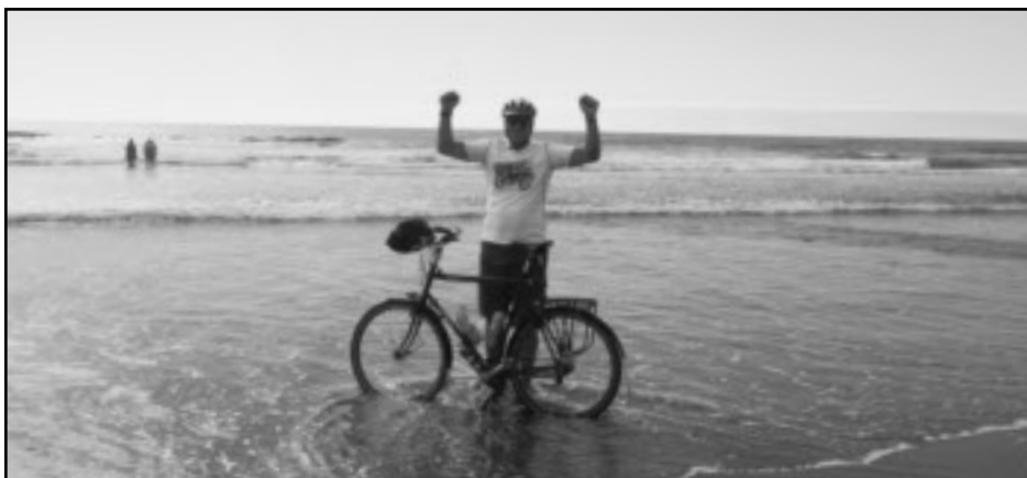
When I returned home, I dipped my bike wheels in the Pacific

My entire journal for the bicycling trip (and my other bicycling adventures) can be found at www.bigguyonabike.com .