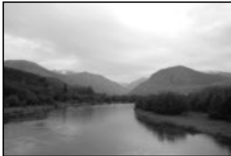
You see a quieter, more beautiful side of America while on a bike. The Rosebud River in Montana meanders through gorgeous country

Less than two hours ago a sense of accomplishment washed over me as I completed a steep climb out of Idaho's Salmon Wilderness area and over the summit of Lolo Pass to cross into Montana. Now was supposed to be an enjoyable, easy 2,000-foot descent over the last 35 miles into Missoula. Instead, as I crested the summit a stiff headwind nearly toppled me over. Storm clouds brewed on the horizon. Stopping early was problematic. The Lions who awaited me did not know me but they believed in my trip and me. That thought energized me. I pedaled hard, envisioning the Lions cheering me on.