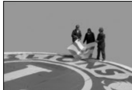
Italian Lions used this street logo on Lions Day

Florence guides and friends of the museums agreed to coordinate visits to lesser known parts of the city. Leos held a walk to call attention to their service.