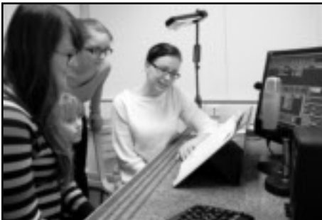
Leos in Finland record classic stories and fairy tales to be posted online for visually impaired children

Questions also swirl around literacy for those with visual impairments and other disabilities. What are the barriers to inclusion and how can vision care improve school performance? Finally, regarding the role of technology, how can e-readers, mobile devices and other innovative tools improve literacy?