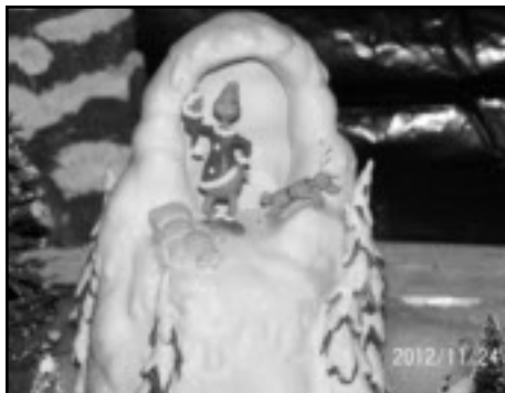
The Grinch with Max the dog on Mount Crumpet

On Tuesday March 26, 2012, the Gloucester North Lions Club distributed the proceeds from the Magical Village that was held at the Place d'Orléans Shopping Centre from Nov. 24 to Dec. 24, 2012.