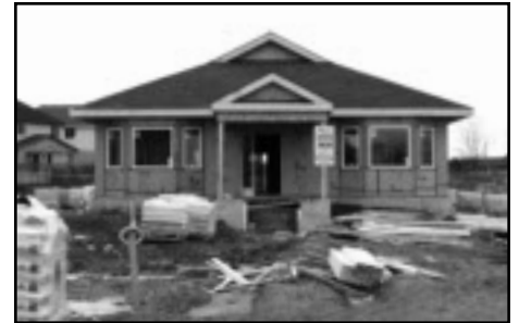
Lions Martins House