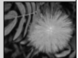
A red powder puff at the Planten and Blomen