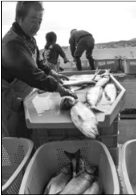
Salmon are brought to the Shizugawa fishing port. The recovery of the fishing industry in the Miyago area is crucial to economic development

housing in short supply, enrollment dropped from 450 to less than 50.