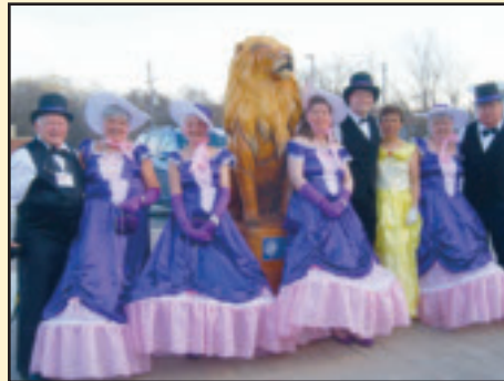
Owen Sound Scenic City Lions dress for A9 Convention evening program at Opera House