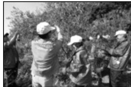
Lions harvest olives on Shodo Island

A stone sign near a quiet road on Shodo Island in Japan reads: Lions Forest—Shodoshima Lions Club . Each October the forest comes alive with Lions: they gather amid the olive trees to handpick tiny olives. The work is laborious, but Lions find it fulfilling.