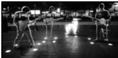
The Beatles are remembered at Reeperbahn, where they honed their chops

Load up on the cuisine – there’s so much to see and do you’ll need the calories. Try to explore beyond downtown so you can sample some of Hamburg’s residential and working suburbs, which make the city