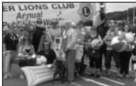
Marchers in the Publicans Walk have fun while raising funds for good causes