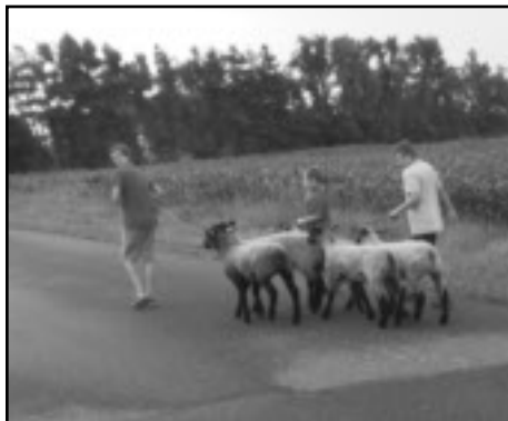
One of my surprise encounters was a group of boys near Abbotsford, Wisconsin, out early guiding sheep right down the road. I was not sure where they were going, but it looked like they were having an interesting time keeping them headed in one direction

My journey reminds me of that wonderful Bill Murray movie, "Groundhog Day." Basically, I get up early, eat, ride 50 to 100 miles while munching down what I find along the way and turn in for the night not long after I get off my bike. My mind and body both have acquiesced to this routine. Instead of being worn down and perpetually sore, my body has been resilient and adjusted to the pace.