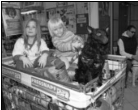
Shoppers filled a cart for guide dogs (children not included)