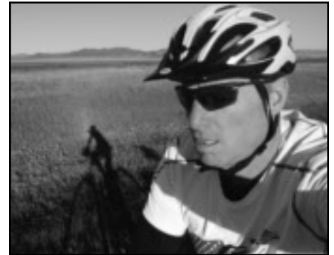
Trust me: it's a big country and a long way from coast to coast. Here I am on Day 27 as I head from Green Bay, Wisconsin, to Ludington, Michigan, a relatively short jaunt of 45 miles