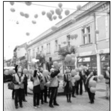
Oradea Lions launch blue balloons in a historic public square to raise awareness of diabetes

The Oradea 22 Lions Club began the camp five years ago. Founded in the 12th century, Oradea is an elegant city of 183,000. Diabetes in Romania, as elsewhere, is becoming ever more prevalent.