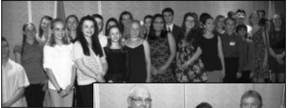
The District winners gathered to participate in the MDA Effective Speaking Competition