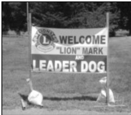
Randall Lions in Minnesota made a banner