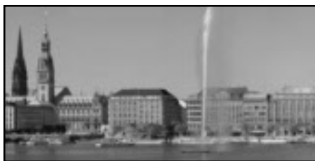
The views are grand at Alster Lake in Hamburg