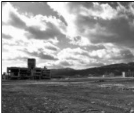
The downtown of Rikuzentakata was almost completely washed away without a trace