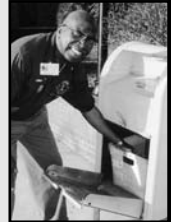
Williams says "giving is a happiness."

Quote: "When you're comfortable in your own skin, you can be a comfort to someone else."