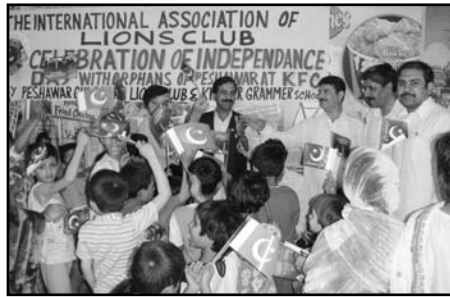
Lions and orphans celebrate their nation's Independence Day.

What the orphans share in common is the goodwill and generosity of the Peshawar Gulbahar Lions . Club members provide clothes, shoes, toys, sports equipment and school supplies. They clean the building. A Lion who is a physician is on-call around the clock to treat illnesses and injuries. Lions take the children to KFC (Kentucky Fried Chicken) to celebrate Independence Day in Pakistan, and on a religious holiday the children devour a Pizza Hut lunch and watch a magic show.