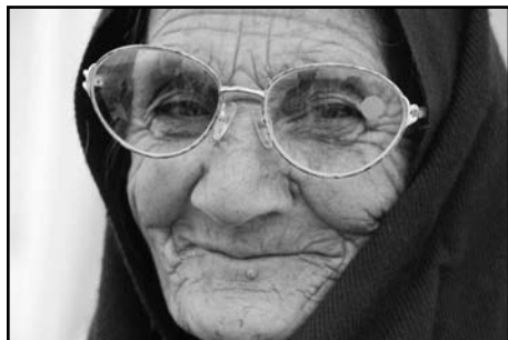
An elderly Afghan woman tries on much-needed eyeglasses distributed by members of the Kamehameha Lions Club of Honolulu, Hawaii.