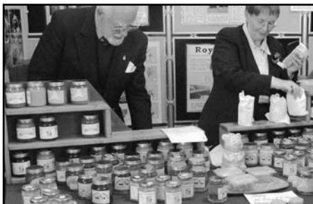
Merchants sell honey.

The Callington Honey Fair is one of only two of its kind in England. The fair actually began sometime in the latter half of the 19th century. It ended during World War II. Then one day in 1978 a local man turned to a friend and remarked, "Do you realize what today is? It's Honey Fair day and there isn't a soul in sight."