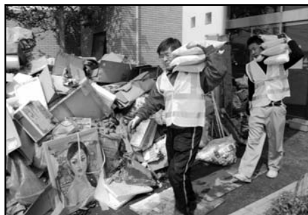
Shiogama Lions Club members unload a truck with 10 tons of rice and boxes of baby diapers for distribution by Lions in Ishinomaki City.

On March 13, two days after the disaster, the eight council chairpersons of Japan held a special meeting. They established a disaster relief headquarters and asked for donations of 3,000 yen (US$35) per member. They also organized a disaster relief support team at MD 330 located near the affected areas to supply provisions made possible through US$1.25 million mobilized by LCIF. Each of the affected districts, 332-B (Iwate), 332-C (Miyagi) and 332-D (Fukushima), as well as MD 333 (Tochigi), established a distribution center and a traveling Lions supply team.