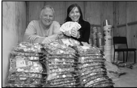
Old money will fund new projects for Lions in New Zealand.

The Reserve Bank estimates that much is lying around in outdated currency. In 1967, the country replaced the pound with the New Zealand dollar. In 1991 coins replaced paper dollars and in 2006 the size of some coins was reduced and other coins phased out.