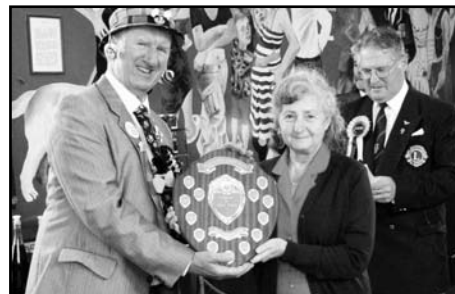
An award winner is honored.