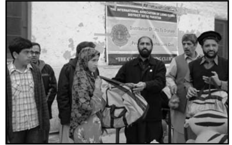
Lions give the children bags of needed items.