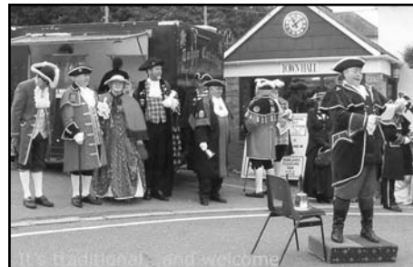
A town crier gets heard.

So the fair was revived, and the Callington Lions Club took it over after its first year. Every October Callington, a small town of 5,000 in southeast Cornwall, is transformed into a honey-lovers paradise. Merchants at the 100 stalls that line the streets sell honey products. The town hall hosts Honey Fair cream teas: teas with bees. Fairgoers vote for their favorite honey foods.