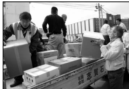
Yonezawa Matsukawa Lions Club members deliver rice, fruits, clothes and disposable masks to Lions in Shiogama City.