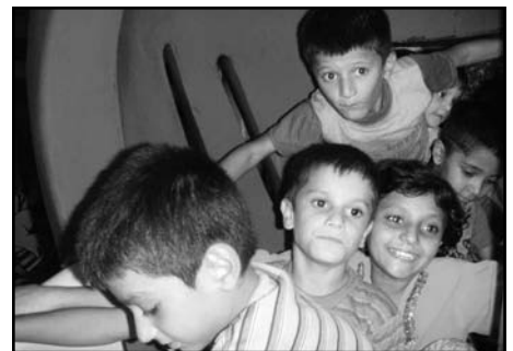
The children play during an outing.

The Peshawar Gulbahar Lions Club began in 1998. It has held 64 eye camps. Lions have screened nearly 45,000 at the camps, distributed 27,300 eyeglasses and sponsored about 4,000 cataract surgeries and corneal transplants for 19 children.