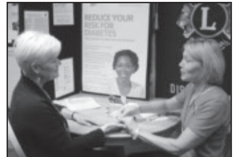
With funding support from LCIF, Lions in Minnesota are increasing their community outreach and education programs

For information on LCIF's diabetes grant programs, visit www.lcif.org