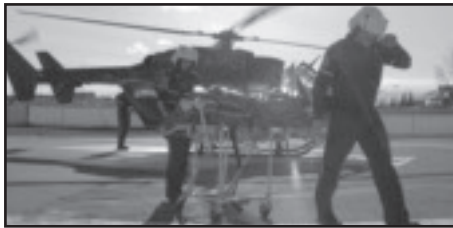
Saving many lives, STARS has completed 19,000 missions

In fact, STARS was originally named the Lions Air Ambulance Service after the Lions of Alberta Foundation gave $100,000 in seed money. Lions funded the initiative when the medical community brought a dire statistic to their attention—Alberta had a 50 percent higher death rate from trauma when compared to other Canadian provinces’ trauma centres.