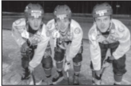
Bandy players in the National League in Finland show support for Nose Day. (Bandy is a form of hockey.)

Last year, for the first time, Lions from several clubs strapped on silly red noses and solicited donations for Nose Day. Proceeds mainly benefit the Finnish Red Cross and its projects for war orphans and former child soldiers in Sierra Leone and other developing nations.