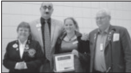
Proof you can have fun in Lionism and still get the job done!