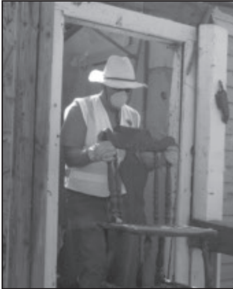
A Lion salvages a chair

The deadliest single tornado in the United States since 1947 tore a path one mile wide and 14 miles