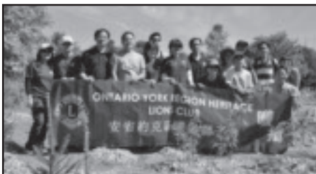
Heritage Lions and friends at the tree planting site at Austin Drive Park in Markham