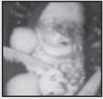
Have you been Naughty or Nice?