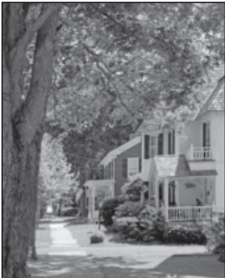
Trees impact school graduation rates and neighborhood crime problems