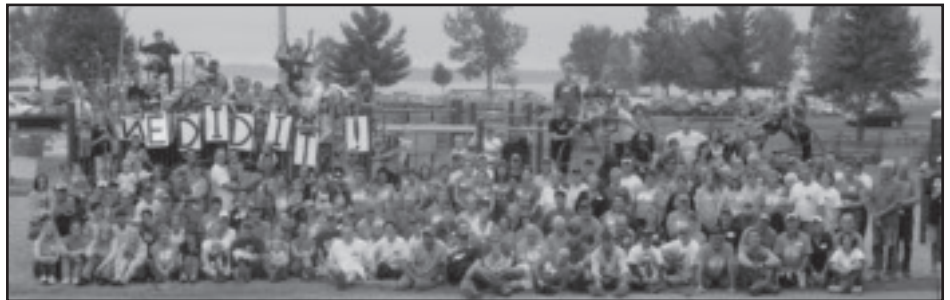
Many of the 275 volunteers participating in the September 24th build of the playground celebrate the completion of the project