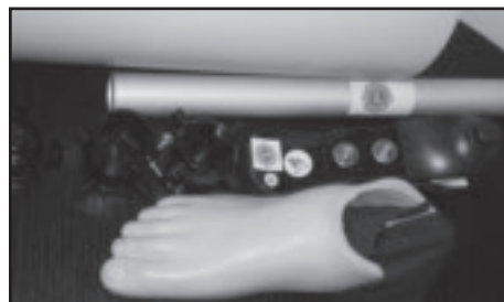
The prosthetics are high quality

So far Lions have delivered 200 artificial legs to Haiti. The goal is to help 1,500 children who lost a leg in the devastating January 2010 earthquake. The high-quality prosthetics are made in Italy with carbon fiber.