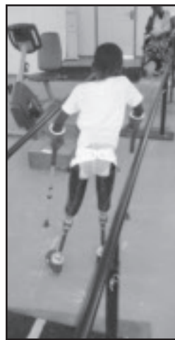
A Haitian child gets accustomed to his prosthetics

Lions in Northern Italy found a novel and easy way to raise cash for prosthetics for children in Haiti: displays on ATMs appealing for a donation of 1 euro.