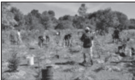
Heritage Lions in action at the tree planting site

Ontario York Region Heritage Lions Club hosted its 3rd annual Tree Planting event on September 10, 2011 at Austin Drive Park in Markham, in partnership with Evergreen and Town of Markham. With over 60 Lions and friends and volunteers coming to the Park on the day, we planted 270 trees in just 2 hours at the Park.