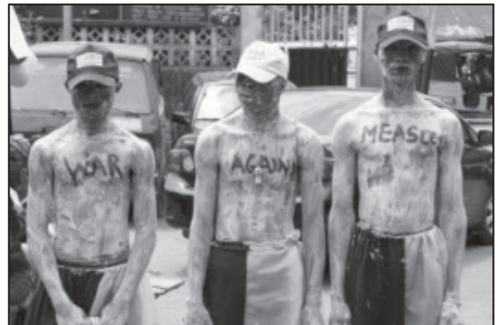
Lions help to raise awareness of the need for measles vaccinations through a public demonstration in Nigeria

To learn more about this program and grant, visit www.lcif.org .