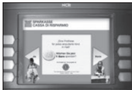
The ATM display asks for a 1 euro donation. (Some of the bank branches are located near the Austrian border, hence the appeal is in German)

Lions in District 108 TAI arranged for signs on 170 ATM machines at 120 branches of Sparkasse-Cassa di Risparmio di Bolzano, the oldest bank in the South Tyrol region. Lions raised 40,000 euros ($56,000) in less than a year. Clubs also contributed funds on their own, bringing the total raised to 300,000 euros ($420,000).