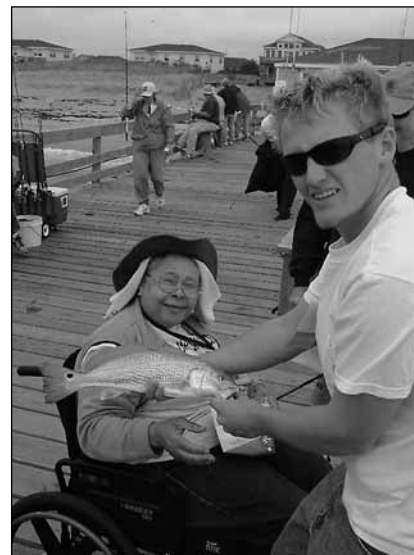
North Carolina Lions organized a three-day fishing tournament for VIPs (visually impaired persons) on the Outer Banks. A list of Lions' projects is now on the Lions' Web site.

For more information on these three programs, visit www.lionsclubs.org or contact the Program Development Department at Lions International Headquarters at: 630-571-5466, ext. 315.