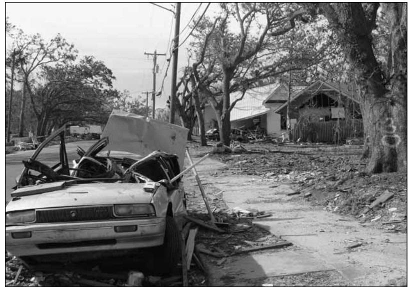
Hurricane Katrina devastated Biloxi, Mississippi. A pro-active ALERT plan can help Lions aid victims of emergencies.

Lions are generous with their time, talents, and resources. The new online Lions Serving Humanity program features a searchable database through which Lions (and non-Lions, too) can request and/or offer to provide services or material/supplies for Lions projects. These offers and requests can aid in an emergency or a long-term non-emergency Lions project.