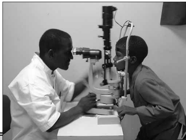
A boy in Niger has his vision checked.

To address the ophthalmic nurse shortage in Niger, a SightFirst grant for $127,551 has been approved to develop a three-year training program at the Lamorde National Hospital in Niamey, Niger. The curriculum is being developed by doctors with the Organization for the Prevention of Blindness in collaboration with WHO. SightFirst funds will provide for some academic materials for teaching the courses, upgrading rooms into suitable classrooms and providing the nurses with basic equipment upon graduation, in addition to other items. Upon graduating from the program, nurses will work at rural hospitals or health centers.