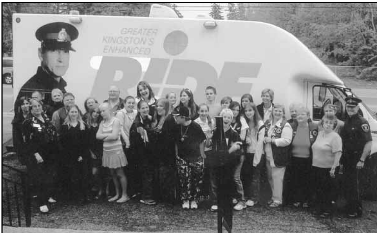
Kingston Lakeshore West Lions Club members, along with some volunteers, stand in front of the Kingston City police RIDE program vehicle. This small club raised the $5000 needed to sponsor five evenings of RIDE operations.