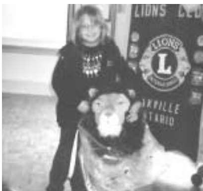
One of the winners with the stuffed Lion as the prize in the colouring contest.